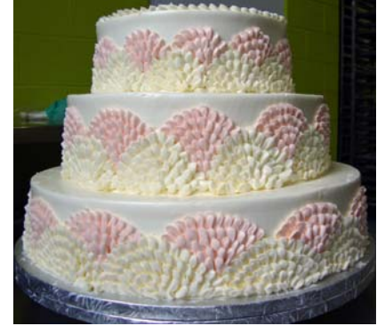
Buttercream Seashells: available on Buttercream or Fondant cakes, tinting extra. Seashell borders are available in 1, 2 or 3-row designs (per tier)