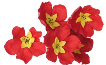
Poppies - size 2" (see #W38) - tinted white chocolate paste - not wired - solid tint with yellow centre - minimum order quantity: 8