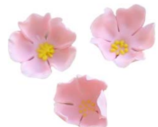
Wild Roses - size 1" - tinted white chocolate paste - not wired - solid tint with yellow centres - minimum order quantity: 12