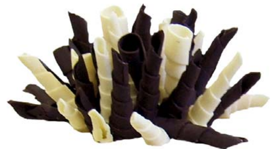
Chocolate Cone Crown