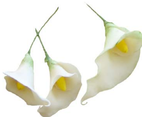
Calla Lilly - size 3-4" - tinted white chocolate paste - wired (not edible) - yellow wired stamen at centre - minimum order quantity: 6