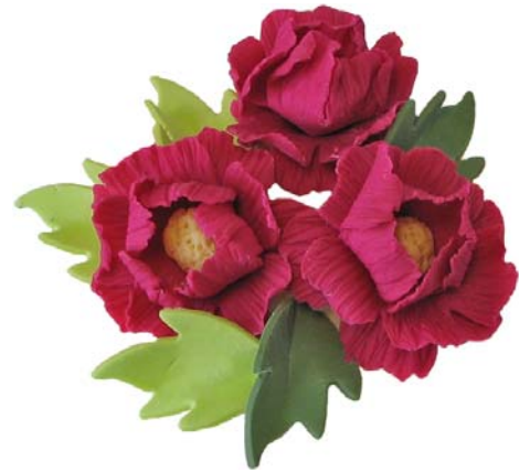
Pink Fantasy - size 4" (see #W16) - tinted white chocolate paste - not wired - solid tint with yellow centre - minimum order quantity flower: 3