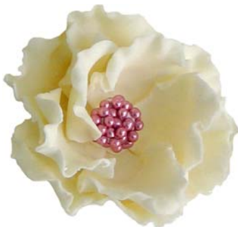
Peony (dragee center) - size 4" - tinted white chocolate paste - wired (not edible) - solid or blush tints available - yellow wired stamen or dragees at center - minimum order quantity: 1