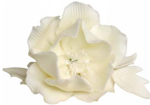
XL Peony with leaves (stamen center) - size 4.5" (see #W38) - tinted white chocolate paste - wired (not edible) - solid or blush tints available - wired stamen - minimum order quantity: 1