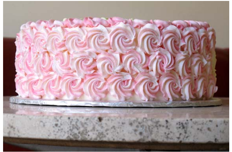
Buttercream Rosette Swirl: available on Buttercream or Fondant cakes, tinting extra.