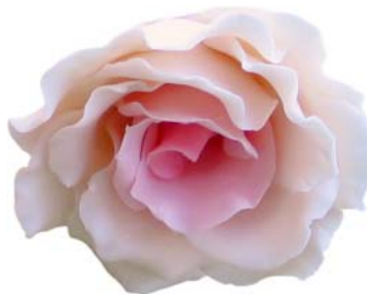
Medium Rose - size 2" - tinted white chocolate paste - not wired - blush tint or solid tint available - minimum order quantity: 6