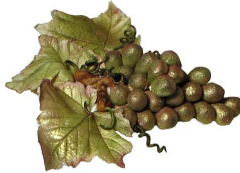
Cluster of Grapes with leaves