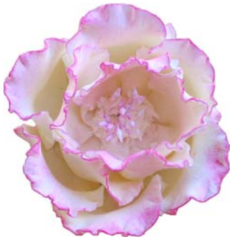
Peony (blush colour) - size 4" - tinted white chocolate paste - wired (not edible) - solid or blush tints available - yellow wired stamen or dragees at center - minimum order quantity: 1