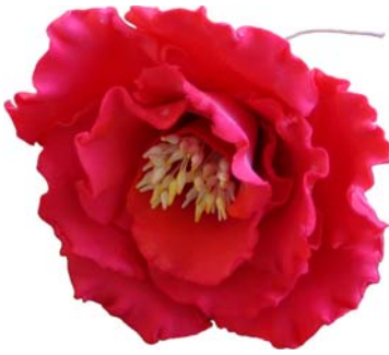
Peony (solid colour) - size 4" - tinted white chocolate paste - wired (not edible) - solid or blush tints available - yellow wired stamen or dragees at center - minimum order quantity: 1