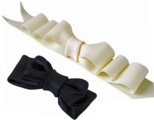
Flat Bow or BowTie