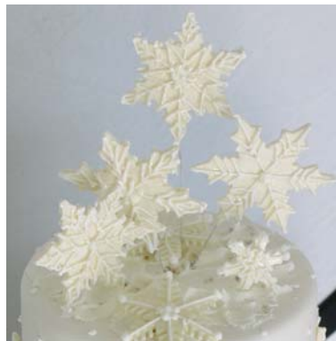
Wired Snowflake Crown