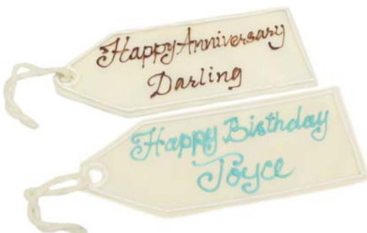
Tiffany Gift Tag