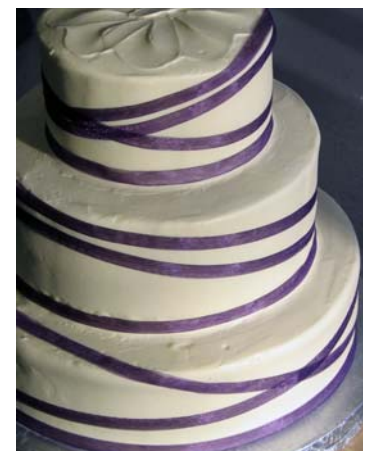
Asymmetrical ribbon wraps (edible or non-edible)