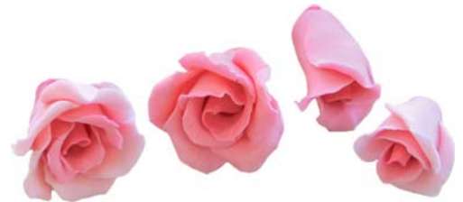
Mini Roses - size 1" - tinted white chocolate paste - not wired - solid tints only - minimum order quantity: 12